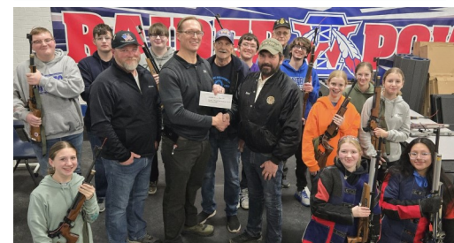
Post and Squadron 551 (Onarga, IL) present The Iroquois West Rifle Club with a check for $1500.