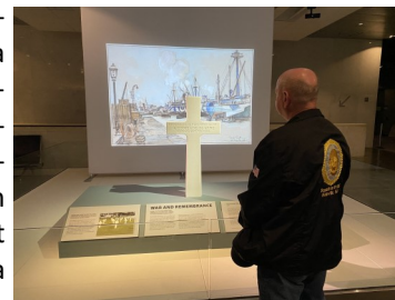
Editor's Photo: "Price of Freedom"

Our Belleville contingent truly enjoyed time at the Air and Space Museum (which requires you register for a timed-entry pass ), and the "Price of Freedom" exhibit at