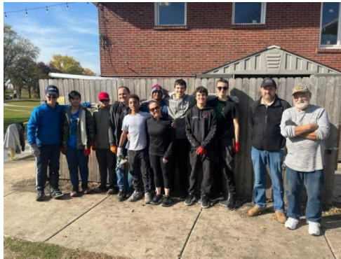
Legiontown, USA photo

On Nov. 2, the Civil Air Patrol helped Post 42 and Squadron 42 members clear the storage yard of weeds and grass. The cadets helped weed, rototill the soil, level the soil, install a weed barrier, position bricks and pavers to prevent weed growth, and facilitate people being able to use and access equipment from the storage shed inside. The shed itself houses picnic equipment including a grill, two griddles, a snowblower, show shovels and other outdoor tools belonging to Post 42.