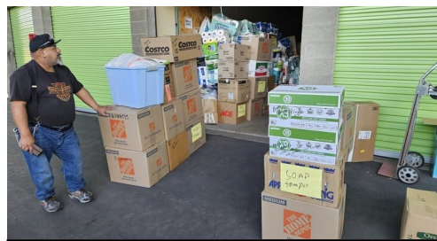
Squadron 283 (CA) filling up storage units with supplies for victims of the wildfires

The Detachment of Georgia has already raised $1,000 for our SAL victims, and the Detachment of California is in the process of voting to fund the relief fund. I am wondering if all of you can compel your detachments and squadrons to help these poor souls. Donations can be made through Ronald Regan Pacific Palisades Post 238.