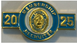
Individual Membership Recruiter Award Pin, 2025

Individual Membership Recruiter Award: Any SAL members who recruits five new members into the Sons of The American Legion during the current membership year is eligible for this award. Award forms must be submitted by June 30.