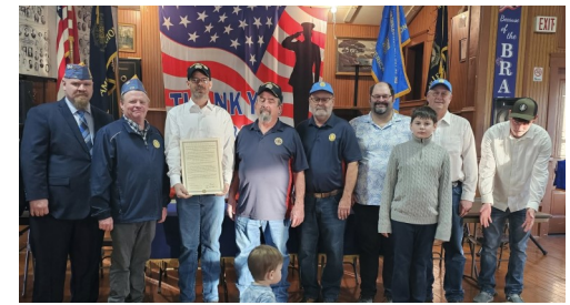
Squadron 502 (Castana, IA) receiving their charter