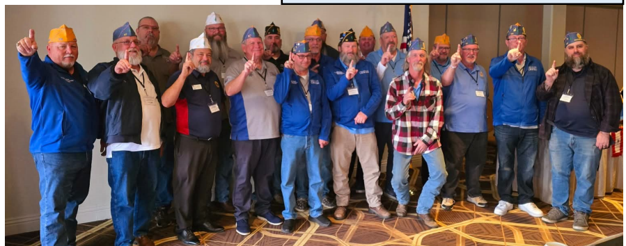
The 2025 Arizona SAL Delegation at Wild Willy's Western Rendezvous in Las Vegas on January 24-25th. It's the unofficial gathering of the Western Region which happens every year.

The trip began with several meaningful stops along the way. SAL members visited Arizona American Legion Post 12 in Wickenburg and Post 14 in Kingman, where they were warmly received