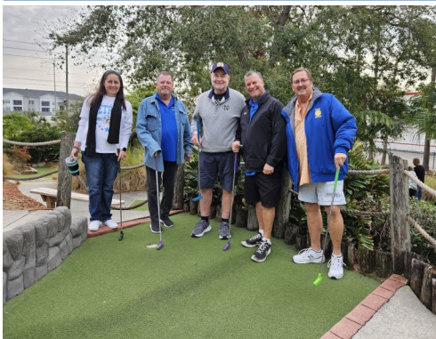
Squadron 238 (Safety Harbor, FL) holding their 4th annual mini-golf tournament, raising money for Hero to a Child and Special Olympics