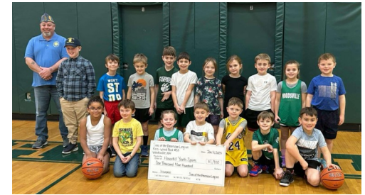
Squadron 20 (Woodsville, NH) donates $1,900 to Haverhill Youth Sports to cover insurance costs