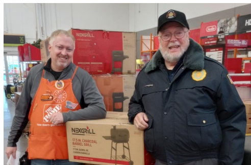
Squadron 4 (Wichita, KS) approaching businesses to donate items for their February 22 Valentine event fundraiser to help homeless veterans.