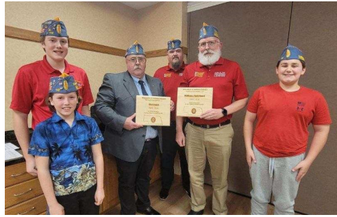
Squadron 112 (Benson, NE) receiving CSR Awards for best C&Y and VA&R report.