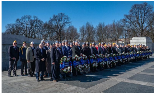
2024 SAL's in Washington

The event happens at the end of February each year, where members of The American Legion and Legion Family make their way to our nation's capitol to meet with lawmakers and discuss the Legion's legislative agenda and priorities, concluding with the National Commander appearing before Congress. This year is the 65th Conference.