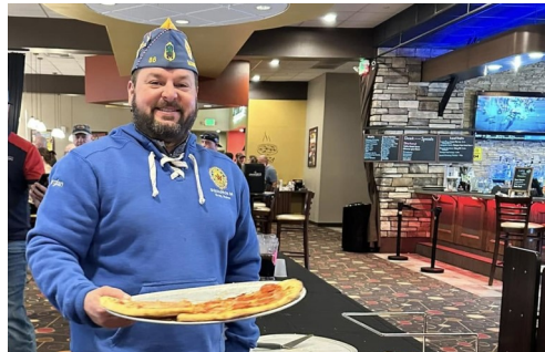
Squadron 86 (Grey, ME) holding a bowling fundraiser to raise funds for their Headquarters Memorial Wall.